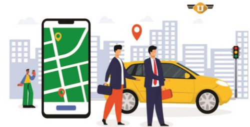
TAILOR MADE END-TO-END ECONOMICAL TRANSPORT SOLUTION