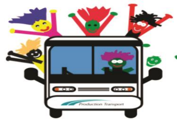
TRANSPORT SERVICE FOR SPECIAL EVENTS