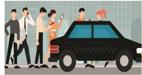
EMPLOYEE TRANSPORT SERVICES