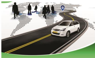
CAR RENTAL SERVICES